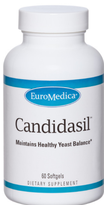
#ER4067 60 Softgels

Recommended Dosage: One softgel with each meal as needed for soothing comfort. Can be taken before, during or after mealtime.