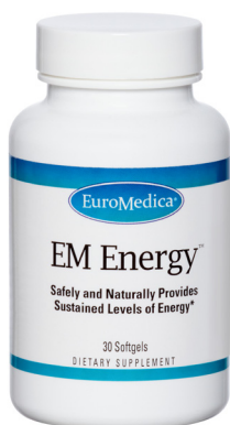
#ER1035 30 Softgels