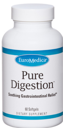
#ER0069 60 Softgels

Recommended Dosage: 1 to 2 softgels at breakfast, or use as needed.